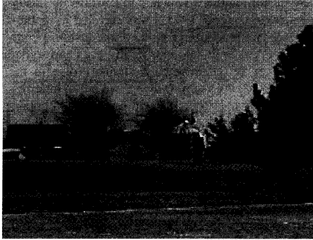
Another 'flying cigar'? (see photo above)

SEATTLE -- The observer was driving south on I-5 and noticed a jet flying east across the sky when another jet appeared without wings at 1 PM on March 8, 2004 . He photographed it. "As I watched it more, there was no jet, and the trail wasn't getting any longer. It was completely horizontal and fairly high in the sky, and as I looked at it more over a period of about a minute, I swear it looked like a perfect row of small windows going down the length of it. It also seemed to have a perfect, long, cylindrical shape, with the windows going down the middle. I could tell it was cylindrical because the top and bottom kind of faded as if there was some roundness to the object. I couldn't tell how high it was in the sky, but the object looked enormous. After about two minutes of watching, the object performed a four second fade out from being completely visible to disappearing completely. I've never witnessed the trail of a jet disappear that quick after being visible for that long."